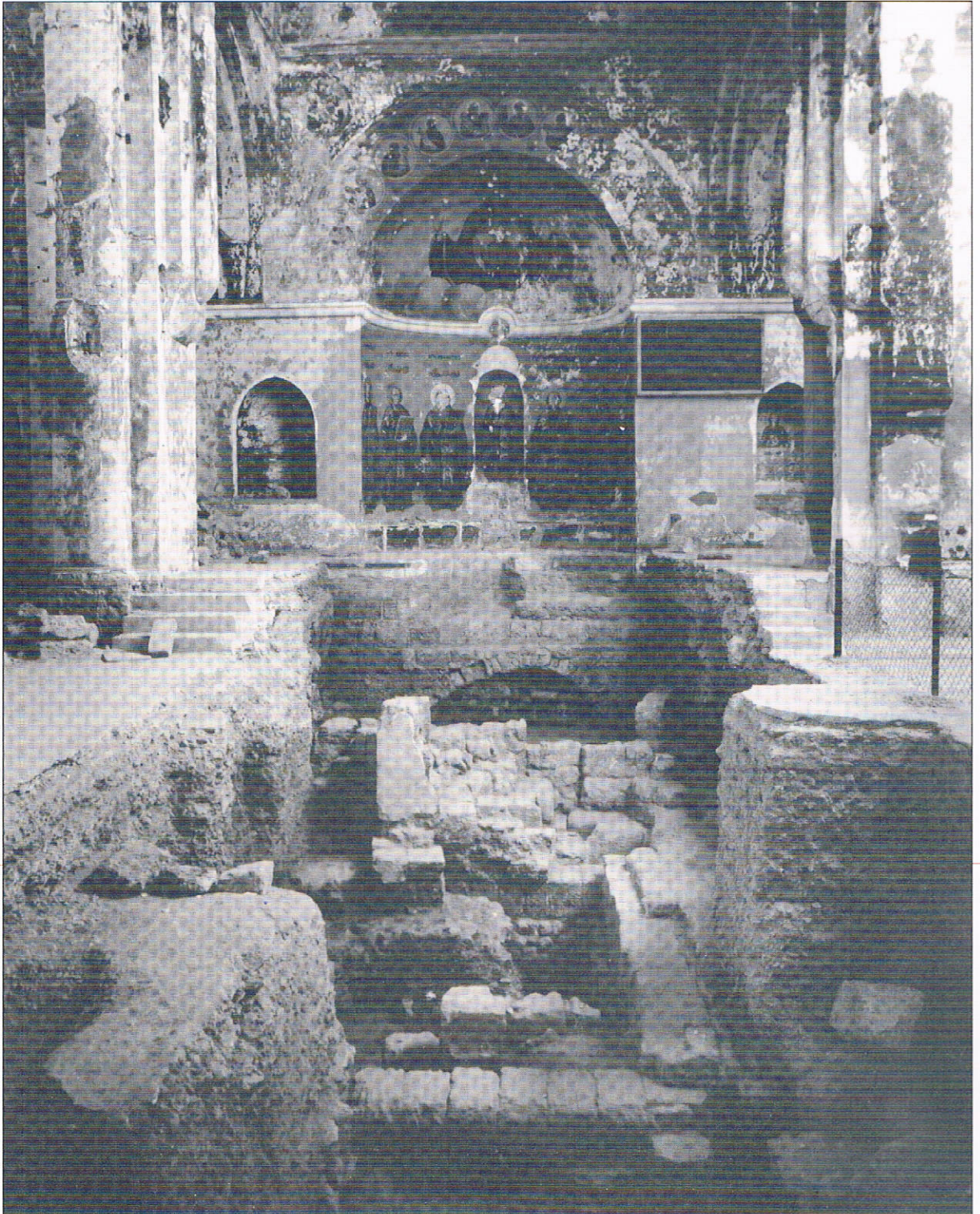
Church interior with Romano-Byzantine excavations