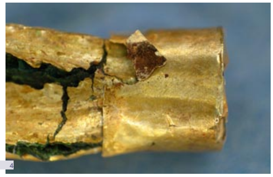
Figures 2 and 4 show the upper cap from the side. The tear in the end cap shows that it encases and covers the upper end of the decorated foil.

Although the interpretation as a pendant that has lost its supporting loop is very likely, it should be noted that Newman states that some cylindrical pieces of stone from Middle Kingdom female burials in Egypt have metal end caps but no sign of having been worn as pendants, appearing rather to be amulets <sup>1</sup>. The Sidon pendant is very similar in appearance to a pendant found at Tell el-Dab'a in the Nile delta (see p. 40).