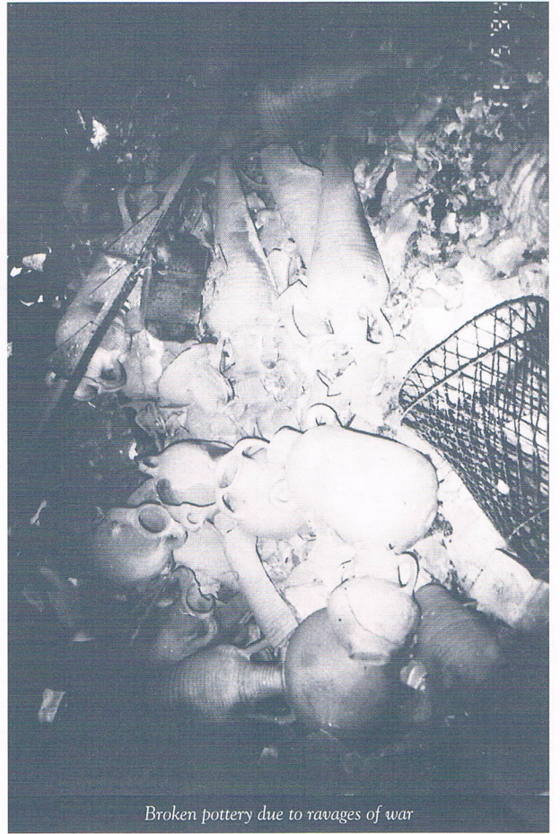
Broken pottery due to ravages of war