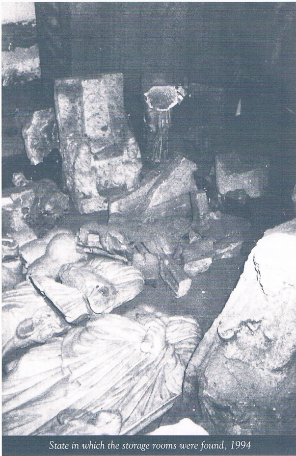
State in which the storage rooms were found, 1994